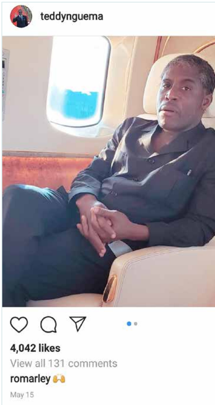
Vice President Obiang often flashes his wealth on his open Instagram feed.

While Vice President Obiang was convicted in late 2017, there are indications that he will not go down without a fight, and that a period of lengthy appeals awaits TI France. 28 In light of this prospect, there have been some missed opportunities for serious advocacy that might enlist regional bodies in the struggle. On January 22, 2018, at its Assembly of Heads of State, the African Union (AU) designated 2018 as the Year of Anti-Corruption in Africa. In a press release issued on the occasion of the launch, AU leaders recognized the corrosive impact of corruption on “promoting democratic governance, socio-economic transformation, peace and security, and the enjoyment of human rights in the AU Member States.” Yet very little in the way of concrete or verifiable results can be identified as having emanated from the AU effort. African civil society was an afterthought in the whole process, with no meaningful space to offer suggestions and drive change.