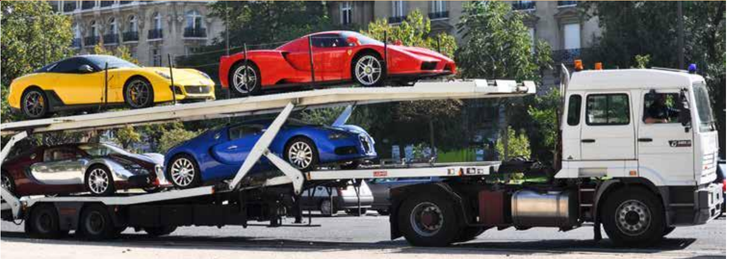
Vice President Obiang's luxury sports cars are seized and towed.

kleptocrat TI should direct attention toward. After Equatorial Guinea failed to make the cut, TI France picked up the campaign, creating videos and other multimedia content to explain Equatorial Guinea's kleptocracy to a French audience.